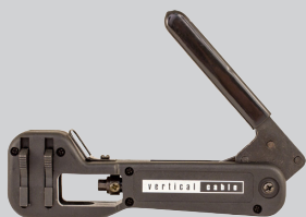
Compression Tool 078-1019