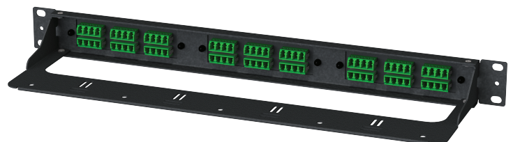
266-PMD01-1A3A (Loaded 264-LAP04-2C6Y1)