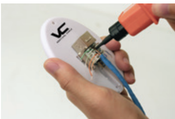
Handheld Gripper 078-1039/U