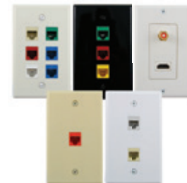
Wall Plates 304, 305, 306, 307, 308 Series