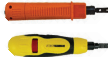
Punch-Down Tools 078-1028, 078-1025